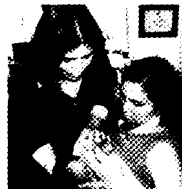
Miami Dade WIC