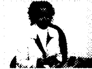
Unity Health Care WIC, Washington, D.C.