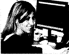
Hialeah WIC - Miami, FL