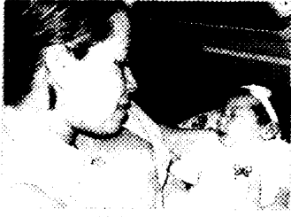
Hialeah WIC – Miami, FL